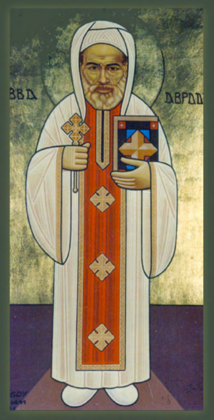
ANBA ABRAAM The Friend of the Poor